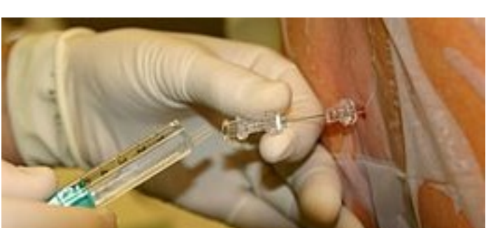
Spinal anaesthesia.